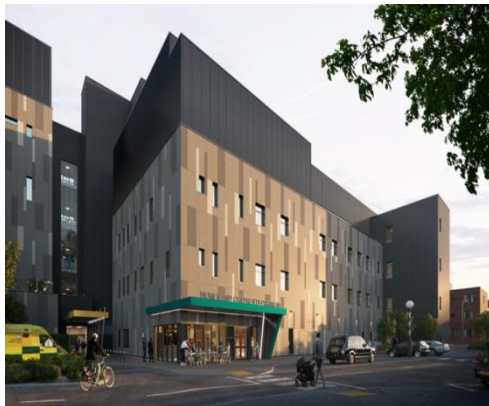
New Ward Block