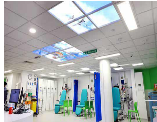
Wide view of new ED waiting area – L&D