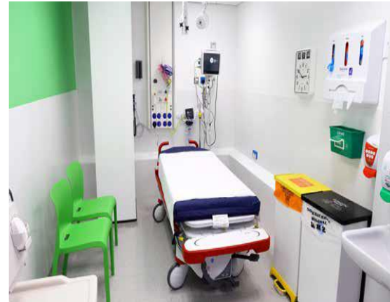
New patient room and bed within ED – L&D