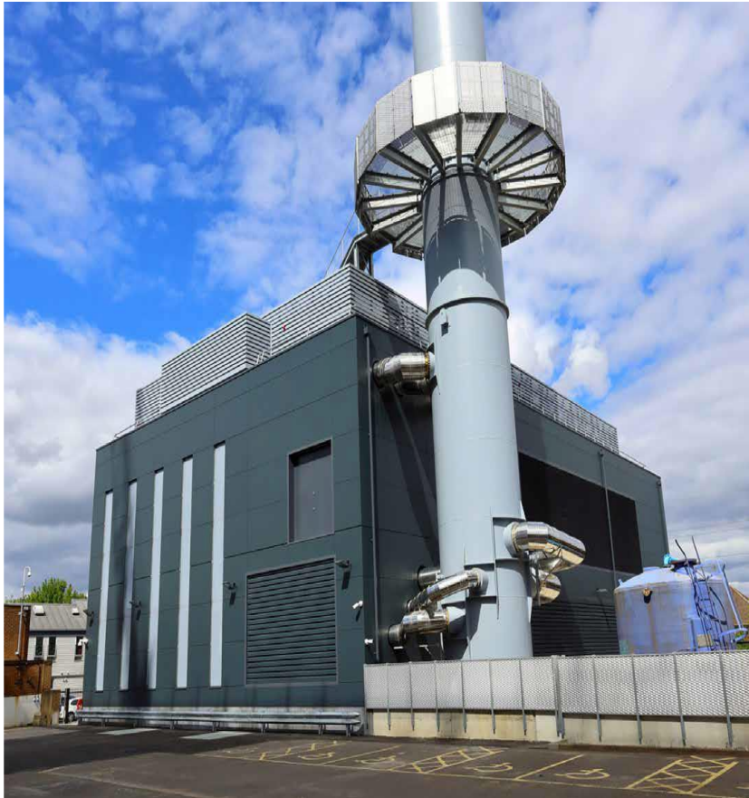
External shot of the Energy Centre – L&D