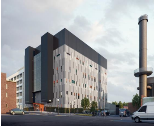
Acute Service Block

£168.8m investment in the estate to bring it up to modern day standards and drive forward advances in medicine, care and technology. Opens 2025.